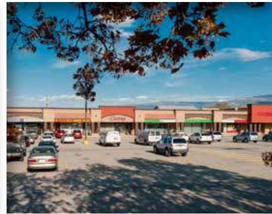
Westridge Shopping Centre